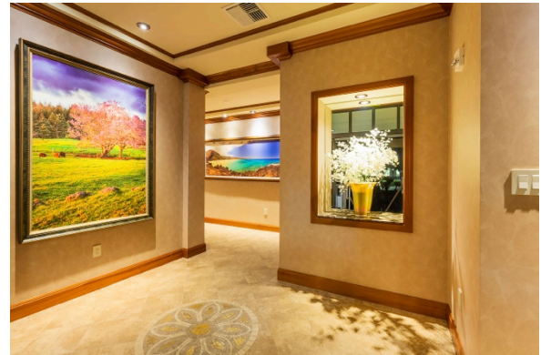
RECESSED ART NICHEs