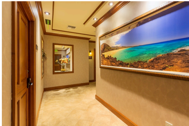
AFRICAN SAPELE MAHOGANY TRIM