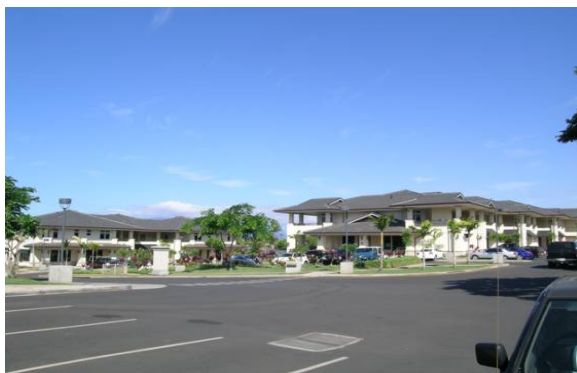
VIEW OF "C" BLDG FROM "A" BLDG