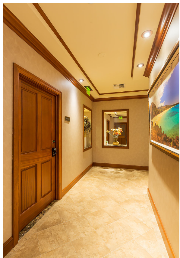
AFRICAN SAPELE MAHOGANY DOORS