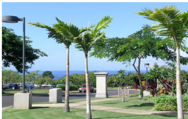
ONE MINUTE TO THE SHOPS AT WALEA