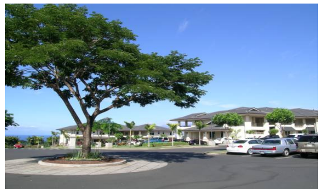
MAIN MOTOR COURT