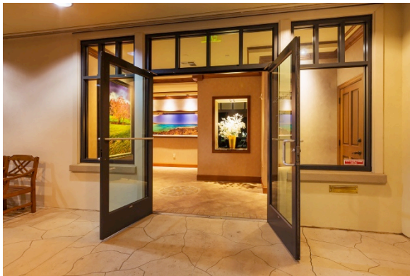
CERAMIC FLOOR MEDALLION MOSAIC