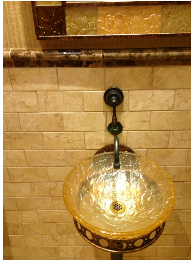
HANDCAST GLASS SINK